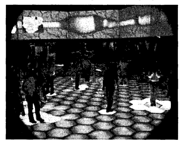
Figure 2: A typical live user interaction scene within Ada. Visible are floor tiles, a light finger highlighting a visitor (centre left), a dynamic 3D visualisation (top) and a live gazer video on the screens (top left).

station, May 2001, 100,000 visitors), where a system called Gulliver was run for three days in collaboration with the Remote Sensing Laboratories in the Department of Geography of the University of Zurich. Gulliver contained light fingers that could follow visitors, and a floor used as a large collective joystick to control a simulated flight over Switzerland. Zürifäscht, the triennial Zurich city festival in July 2001, provided the setting for the next system test. This time a more Ada-like system called Gulliver II was deployed over three days, including a raised area from where spectators could observe the space, and some displays showing the internal operations of Gulliver. Some basic Ada functionalities were tested, such as visitor tracking with floor tiles and light fingers, displaying visitor trajectories on the floor, sound localisation of handclap noises and a group football game. The two key issues that stood out from the results of the tests were the need for effective visitor flow control, and the importance of communicating Ada's intentions clearly through the use of effective cues and visitor pre-conditioning sequences.